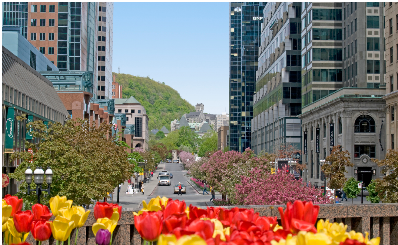
McGill College Avenue – showing McGill University and Mount Royal