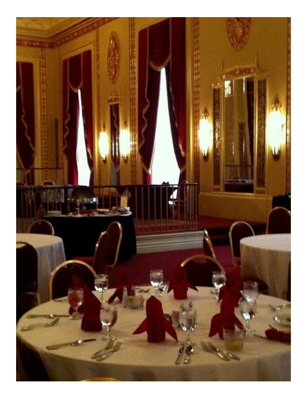
Empire Ballroom, Hilton Milwaukee