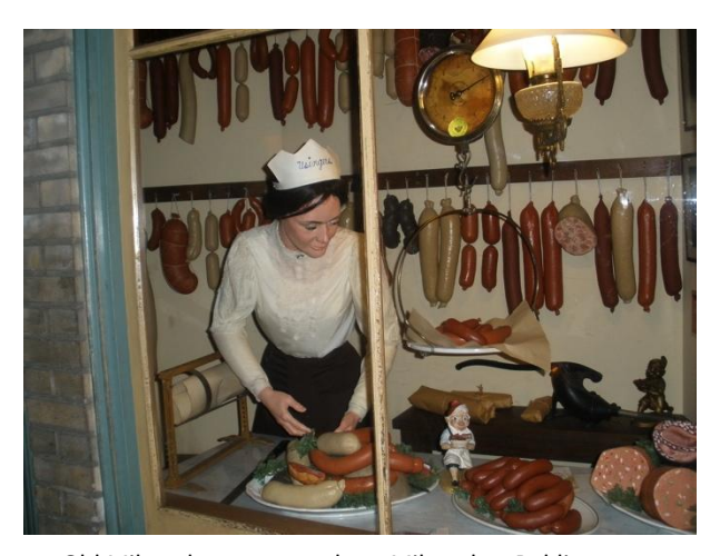
Old Milwaukee sausage shop, Milwaukee Public Museum

If you've never attended an ELUNA or are thinking about submitting a program proposal and wondering what has been offered in previous years, don't forget that ELUNA conference presentations are archived on the ELUNA document repository at <a href="http://documents.el-una.org/view/divisions/eluna=5Fconf/">http://documents.el-una.org/view/divisions/eluna=5Fconf/</a> (login required).