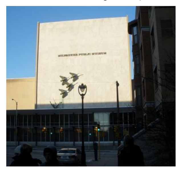
Milwaukee Public Museum will be the location of the ELUNA 2011 reception

Milwaukee is famous for beer, sausage, and Harley-Davidsons, but it also has a stunning Art Museum, awesome Lake Michigan views, and the Milwaukee Brewers baseball team with their unique racing sausage mascots. (And the Brewers are scheduled to be at home at Miller Park during our visit!)