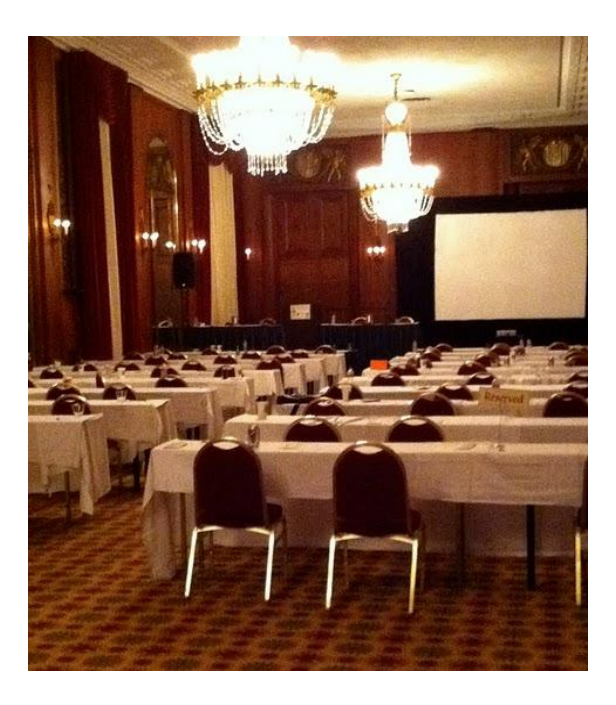
Monarch Ballroom, Hilton Milwaukee