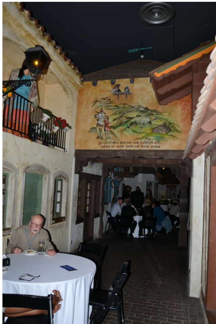
One of the "streets" in the Milwaukee Public Museum