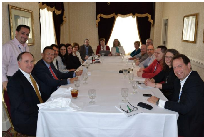
ELUNA Steering Committee has a working lunch with Ex Libris executives at ELUNA 2011