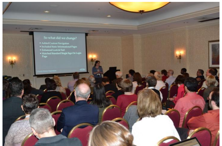
Breakout session at ELUNA 2011