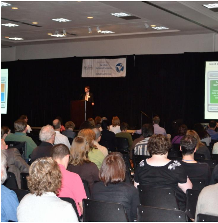
Plenary session on Next Generation system at ELUNA 2011