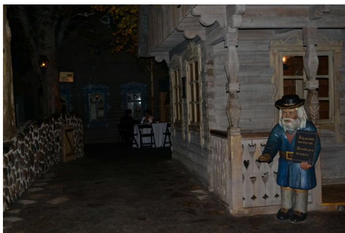
ELUNA Visitors are greeted at the Milwaukee Public Museum