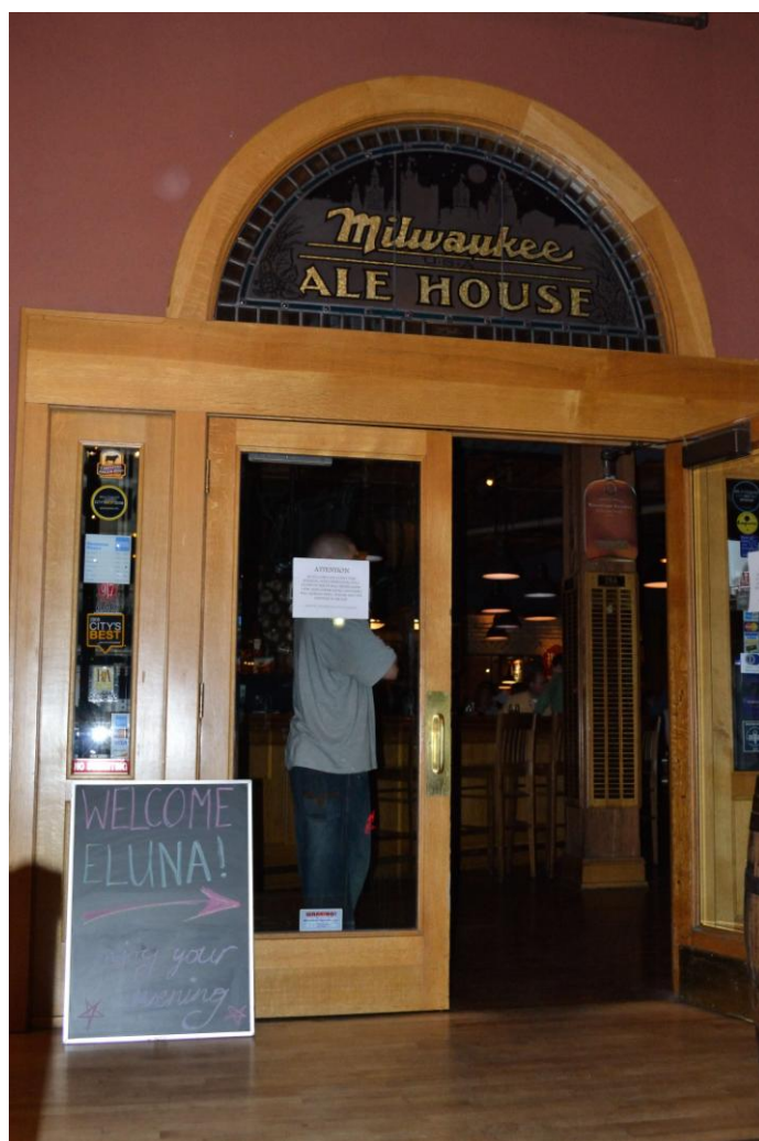
The Milwaukee Ale House welcomes ELUNA attendees for a fun evening

Themes of change, and changes to come, continued as conference attendees were presented with a plenary session update on Alma, and later given the opportunity to attend one of six Alma demonstrations. Ex Libris management also provided their annual corporate update, answered questions from the audience at the ever-popular Q&A session, and presented the individual product update sessions. Ex Libris will be making their corporate and product update session slides available in the Document Center of the Ex Libris Customer Center under Presentations/ELUNA/2011