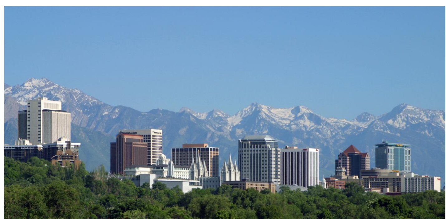
Salt Lake City Skyline with Wasatch Range in the background

Become a new member of ELUNA or renew your existing membership so you can take advantage of everything that ELUNA has to offer.