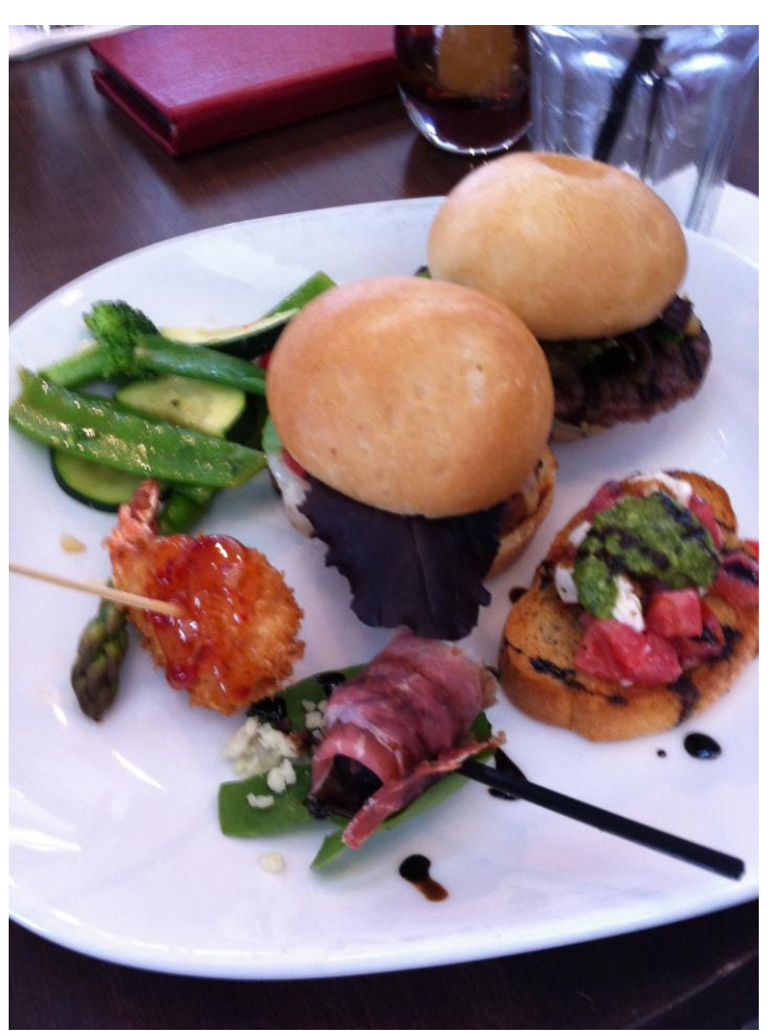
Beer, wine, veggie or meat sliders, shrimp, and more will be included in your $20 ticket to Gracie's on Thursday night of ELUNA 2012.

Primo enhancement submittals and voting (via NERS) is about to begin again. More information will be released shortly detailing what enhancements were migrated from last year, how to submit new enhancements, and when the voting will occur so that we can submit them to Ex Libris in time for the next development cycle.