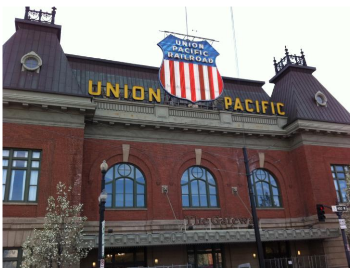
The Grand Hall at the former Union Pacific Depot, Gateway Center, will be the site of the Tuesday night reception.

discussion of how Ex Libris is paving the way for managing staff transitions to maximize the opportunities for improvement with Alma.