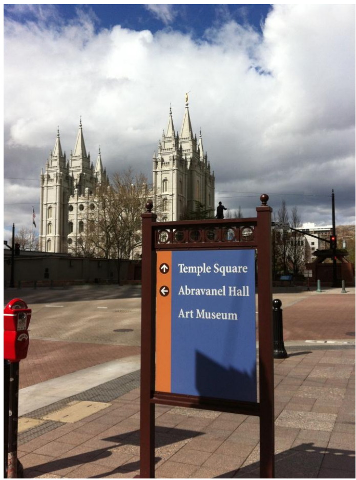
Temple Square, Salt Lake City

The Primo Product Working Group (Primo PWG) is excited about ELUNA 2012 in Salt Lake City, Utah. It is looking to be a great conference and Primo is extremely well represented. The Technical Seminars (May 7-8) will have two "tracks" dedicated to Primo and the General Conference (May 8-11) has 21 Primo sessions planned. As Primo becomes a more mature product, the sessions are more wide ranging in topics. Many more sessions reflect the development work institutions are putting into Primo to get it to do what they need in order to better serve their patrons.