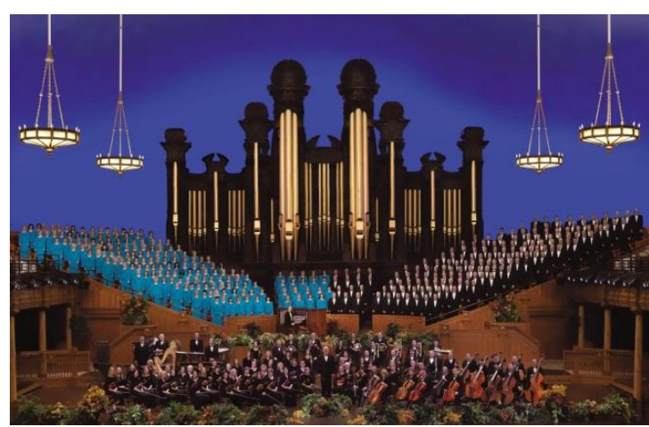
World-famous Mormon Tabernacle Choir and Orchestra - Salt Lake City

Our robust program provides a plethora of educational opportunities in Salt Lake City, but there also will be many chances to meet with colleagues and build relationships at the opening reception and networking dinner. The opening night reception on Tuesday, May 8 will be held at the historic former Union Pacific train depot at the Gateway Center, and includes an incredible menu and the opportunity to sample many local beers and wines. On Thursday evening, a networking dinner at Gracie's provides a casual atmosphere for making connections, as well as enjoying some of the wonderful food they have planned for you. The conference also includes the opportunity to see the Mormon Tabernacle Choir rehearse for free!