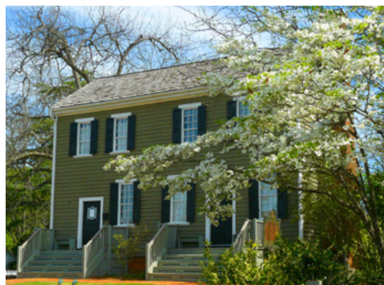
Historic Eagle Tavern Antebellum Trail, Watkinsville

Current number of bars in Athens: 40+ Current number of bars in Watkinsville: 0