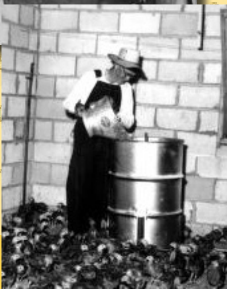
Image Sources: Digital Library of Georgia and New Georgia Encyclopedia