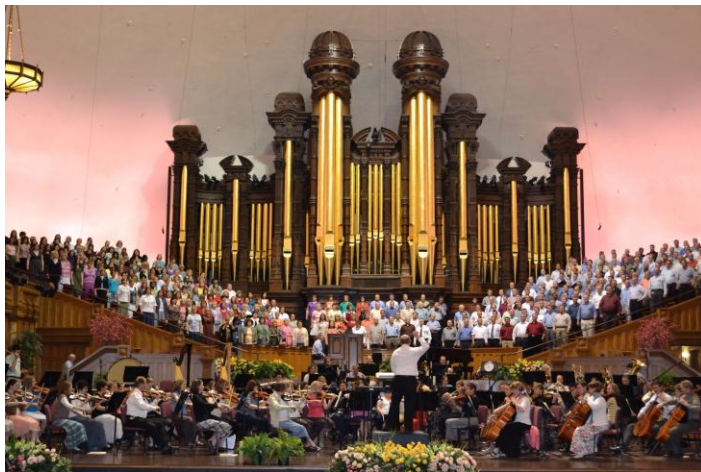
Mormon Tabernacle Choir and Orchestra – Salt Lake City The Choir presented a selection to ELUNA attendees

The SFX Product Working Group is here to serve SFX users. We monitor the SFX List and are involved w/many of the issues discussed. Please feel free to contact us on any on these matters or other problems you may be having. For a list of the current PWG members, see: http://el-una.org/product-groups/sfx-product-group/sfx-product-group-leaders/