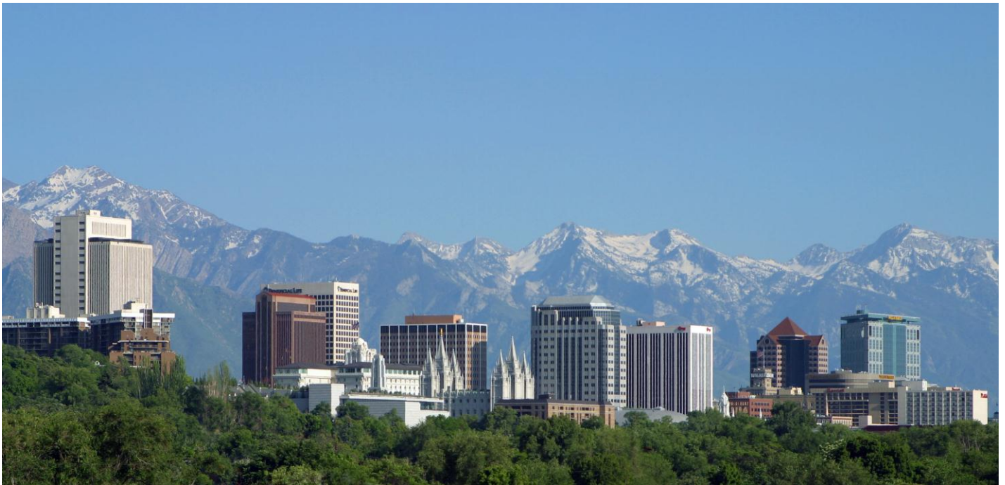
Salt Lake City Skyline with Wasatch Range in the background

Become a new member of ELUNA or renew your existing membership so you can take advantage of everything that ELUNA has to offer.