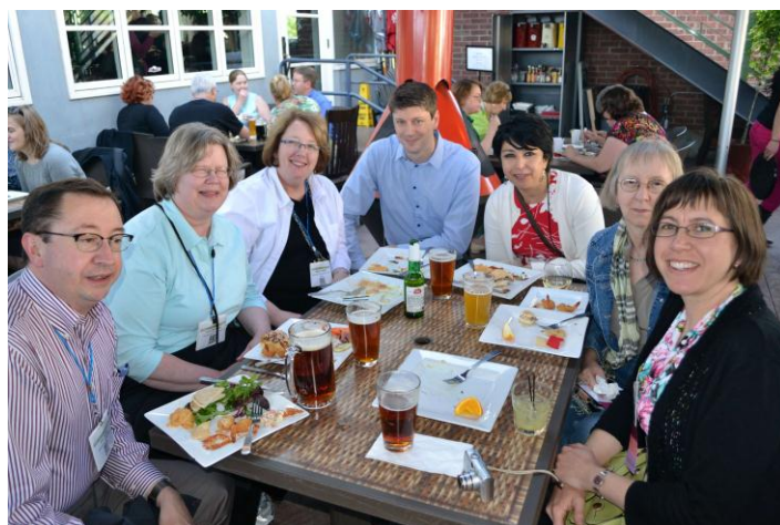
ELUNA attendees enjoying conversation at Gracies

The next year for the Primo PWG promises to be a busy one as the number of institutions using Primo continues to rise and more issues come to the forefront for the PPWG to address.