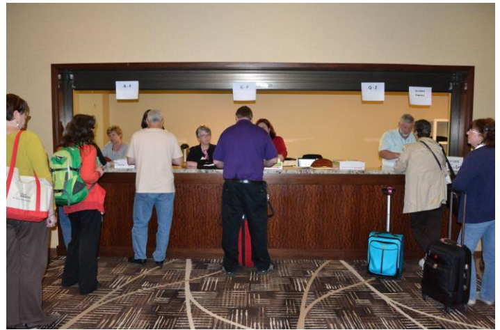
ELUNA 2012 attendees picking up their registration packets