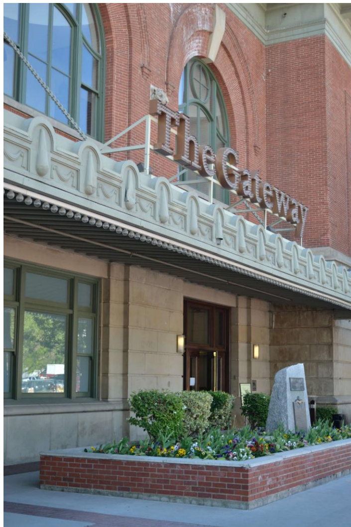
The former Union Pacific Depot, Gateway Center, site of the reception