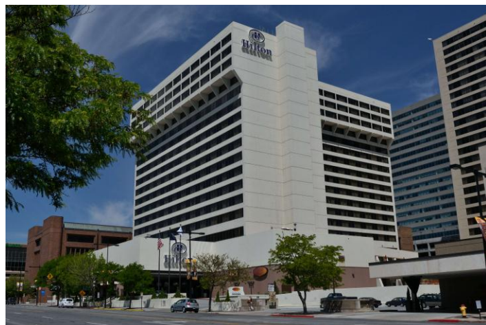
Salt Lake City Hilton, site of most ELUNA 2012 sessions

Read below the Report from the Chair, a report about the conference, an update about NERS, and reports from the various Product Working Groups.