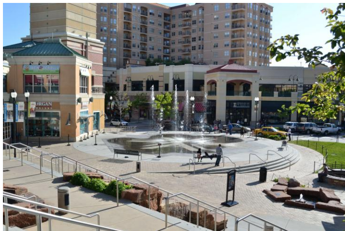
View of Olympic Legacy Plaza from the Gateway, Salt Lake City