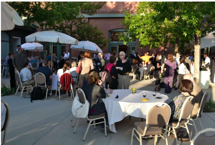
ELUNA 2012 reception at Gateway Center