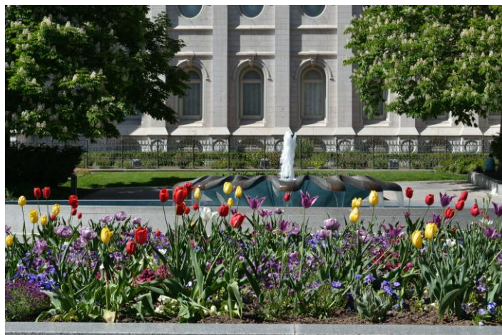
Some of the beautiful landscaping at Temple Square, Salt Lake City

We are looking forward to hearing from you.