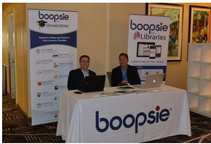
Boopsie, a Gold level sponsor for ELUNA 2012

You liked having the meeting agenda available on the new Boopsie mobile app (56% of survey respondents said they used it, when wifi permitted) but you also still like having print programs.