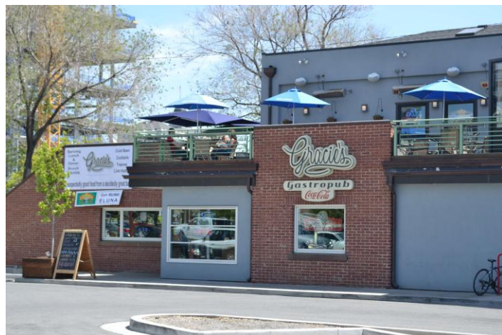
Gracies, site of networking event at ELUNA 2012