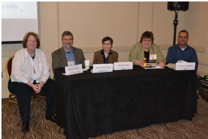
Alma Early Adopters Panel, prepare for their presentation