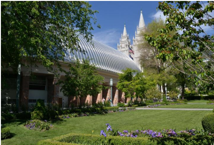
The Tabernacle, site of choir rehearsal with ELUNA attendees as guests

Lastly, in serving its role as a conduit between the membership and Ex Libris, the VPWG will continue to improve its visibility among customers. Visibility-raising efforts will include the improvement of the VPWG space on the ELUNA website, helping to identify programming themes for the Voyager track at the ELUNA 2013 Conference, and participating as requested at regional user group meetings.