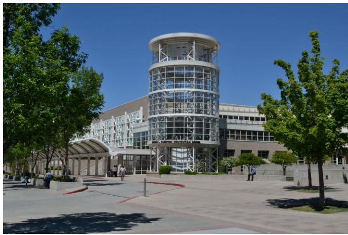
Salt Palace Convention Center, Salt Lake City