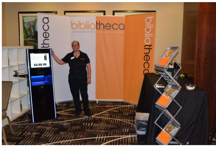
Bibliothecca, a Silver level sponsor for ELUNA 2012