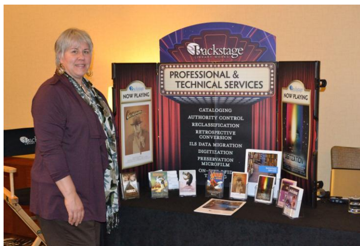
Backstage, a Silver level sponsor for ELUNA 2012

Again, thanks to all the conference planners, speakers, sponsors, volunteers and Ex Libris staff who helped us pull off another ELUNA Annual Meeting! We look forward to seeing many of you in Georgia for ELUNA 2013!