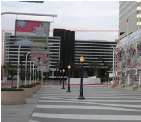
Renaissance Long Beach

The conference reception, sponsored by Ex Libris, was held at the Aquarium of the Pacific, where attendees had access to most of the exhibits, along with food, beverages, and dancing.