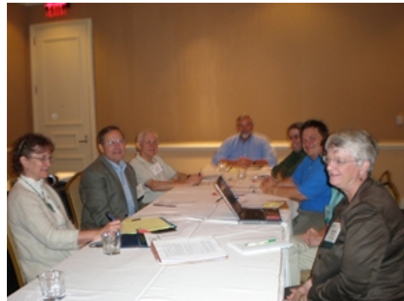
Steering Committee at ELUNA 2008

(our international sister organization) and Ex Libris. The group was established to explore needs and develop priorities concerning the discovery, management and delivery of e-books. The Focus Group issued its final report in April 2008. The report was sent to Ex Libris who issued a response in June, 2008. The full report from the Focus Group and the response from Ex Libris are available to member organizations on the website at: http://el-una.org/web/restricted-pages-toc