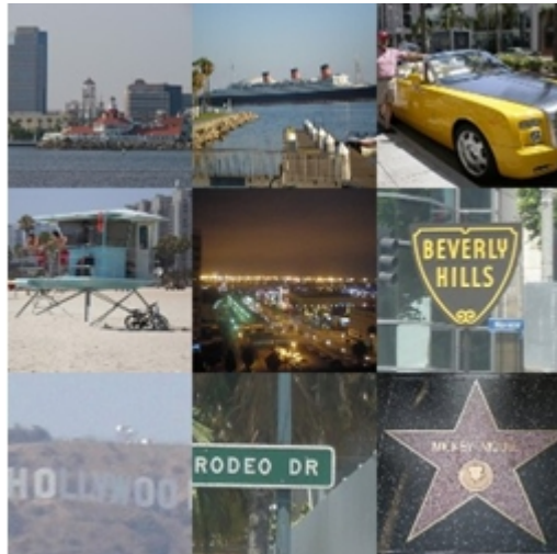
The LA experience