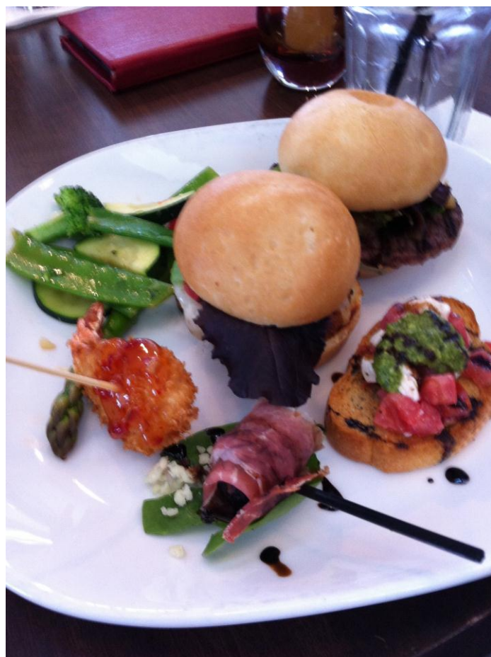
Beer, wine, veggie or meat sliders, shrimp, and more will be included in your $20 ticket to Gracie's on Thursday night of ELUNA 2012.

Primo enhancement submittals and voting (via NERS) is about to begin again. More information will be released shortly detailing what enhancements were migrated from last year, how to submit new enhancements, and when the voting will occur so that we can submit them to Ex Libris in time for the next development cycle.