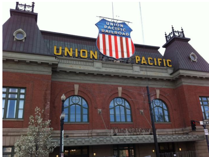
The Grand Hall at the former Union Pacific Depot, Gateway Center, will be the site of the Tuesday night reception.

discussion of how Ex Libris is paving the way for managing staff transitions to maximize the opportunities for improvement with Alma.