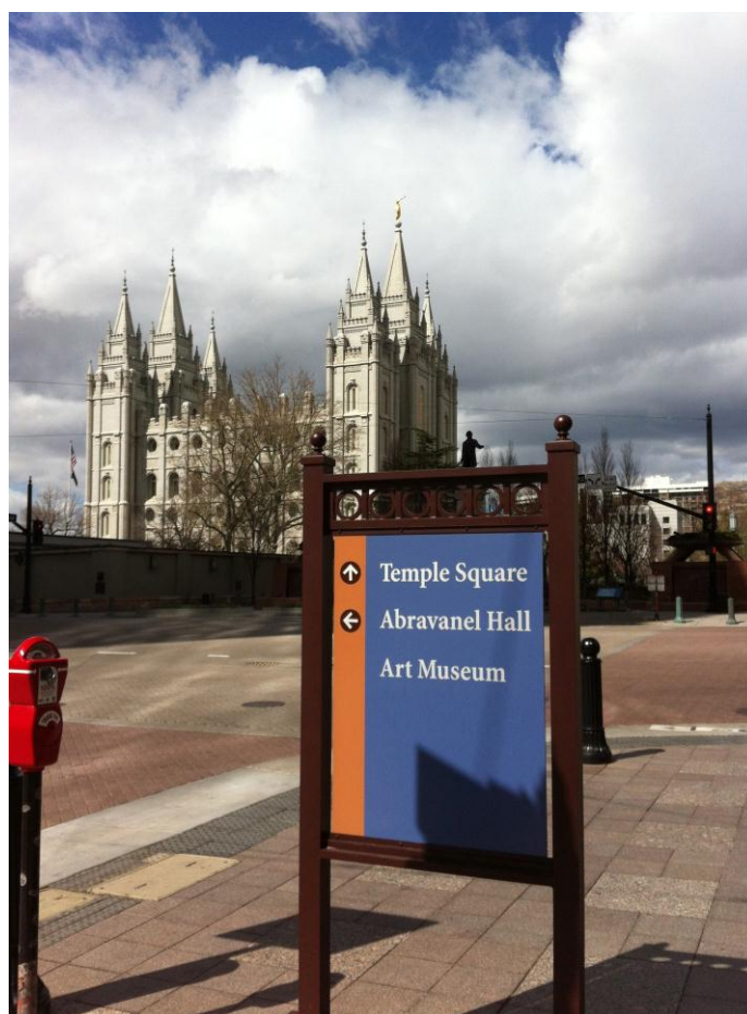
Temple Square, Salt Lake City

The Primo Product Working Group (Primo PWG) is excited about ELUNA 2012 in Salt Lake City, Utah. It is looking to be a great conference and Primo is extremely well represented. The Technical Seminars (May 7-8) will have two "tracks" dedicated to Primo and the General Conference (May 8-11) has 21 Primo sessions planned. As Primo becomes a more mature product, the sessions are more wide ranging in topics. Many more sessions reflect the development work institutions are putting into Primo to get it to do what they need in order to better serve their patrons.