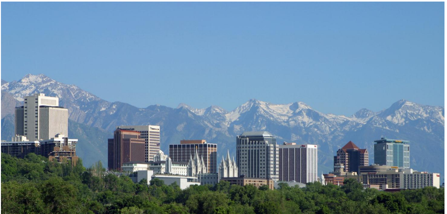
Salt Lake City Skyline with Wasatch Range in the background

Become a new member of ELUNA or renew your existing membership so you can take advantage of everything that ELUNA has to offer.