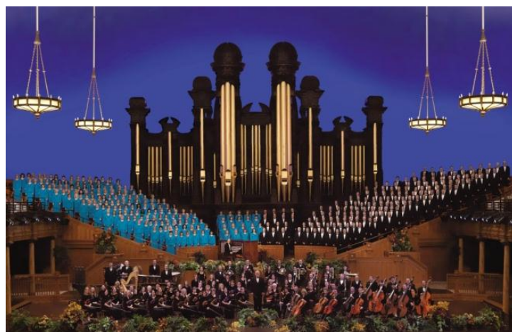
World-famous Mormon Tabernacle Choir and Orchestra – Salt Lake City

Our robust program provides a plethora of educational opportunities in Salt Lake City, but there also will be many chances to meet with colleagues and build relationships at the opening reception and networking dinner. The opening night reception on Tuesday, May 8 will be held at the historic former Union Pacific train depot at the Gateway Center, and includes an incredible menu and the opportunity to sample many local beers and wines. On Thursday evening, a networking dinner at Gracie's provides a casual atmosphere for making connections, as well as enjoying some of the wonderful food they have planned for you. The conference also includes the opportunity to see the Mormon Tabernacle Choir rehearse for free!